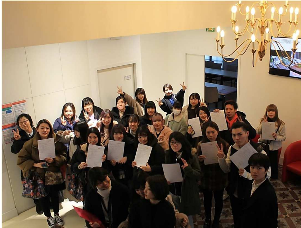
A class from one of our Asian Partners